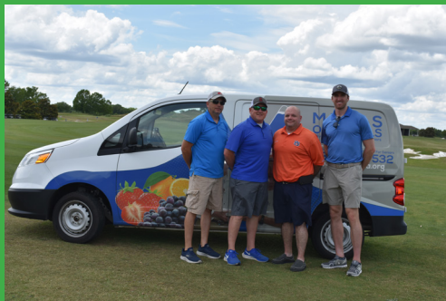
The Auburn University at Montgomery Team