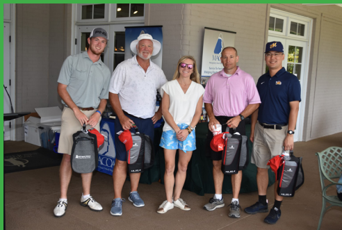
The Gray Television Team