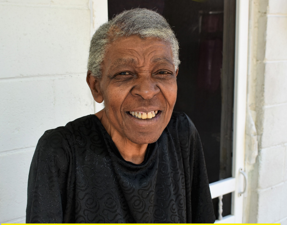
"The volunteers and staff have such love in their hearts. God put them in my life to help me."

Overall, she says Meals on Wheels is "a helpful program with very nice people. God put them in my life to help me. I'm so grateful for all of them."