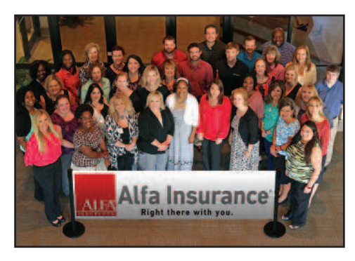
Meals on Wheels Route Partner ALFA Insurance

[NOTE: MACOA is following CDC guidelines to promote a safe environment for their employees and volunteers]